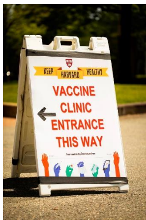
A sign directs members of the Harvard community to an on-campus COVID-19 vaccine clinic, June 2021.