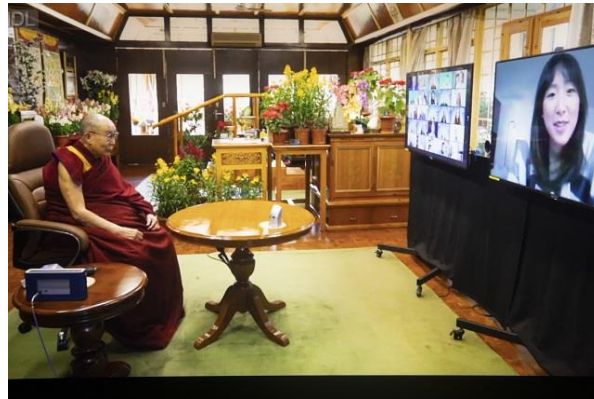
His Holiness the Dalai Lama participates in a virtual event hosted by Harvard Medical School, January 2021.

As the protocol office for the university, the Marshal's Office also advises the Harvard community on an array of sensitive matters. It also vets invitations from departments and student groups to high-profile guests, in an effort to avoid overlap or conflicts, and to retain a historical record of such outreach. This important work continued during the last year, even as all events for which dignitaries were being invited were held virtually.