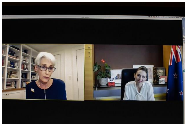
Ambassador Wendy Sherman, Director of the Center for Public Leadership at the Harvard Kennedy School, in a virtual discussion with the Prime Minister of New Zealand, Jacinda Ardern, winner of the 2020 Gleitsman International Activist Award, December 2020.

Harvard University is an open campus that welcomes thousands of visitors from around the world in a normal year. The Marshal's Office makes arrangements on behalf of international individuals and delegations seeking substantive dialogue with members of the Harvard community on shared areas of interest. These individuals include, but are not limited to, government officials, university leaders, and professionals in various fields who participate in fellowships or special programs sponsored by official entities, such as local consulates or the U.S. State Department.