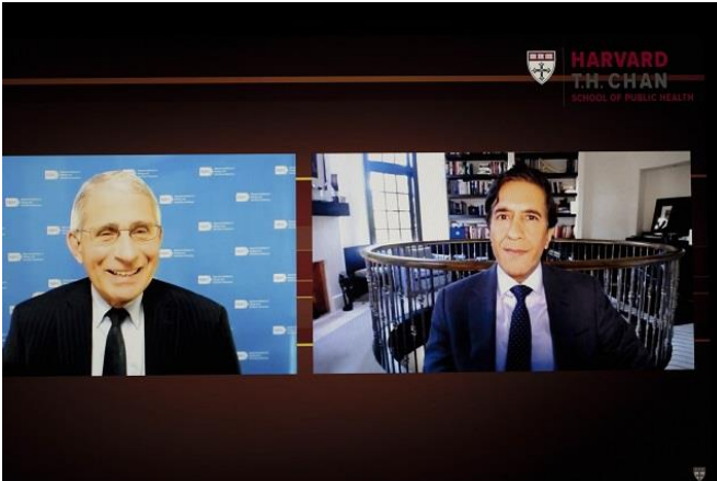
Dr. Anthony Fauci and Dr. Sanjay Gupta in a virtual panel discussion hosted by the Harvard TH Chan School of Public Health, December 2020.

of free speech and open inquiry. With the help of faculty advisors from various departments and centers, the Marshal's Office has developed a set of guidelines on how best to initiate, plan, and manage high-level visits. These guidelines, which were updated in late spring 2020 to address protocol around virtual events, can be found in Appendix A . The Marshal's Office is available to help faculty, students, and staff understand the guidelines and assist in making visits and virtual events meaningful for all parties.