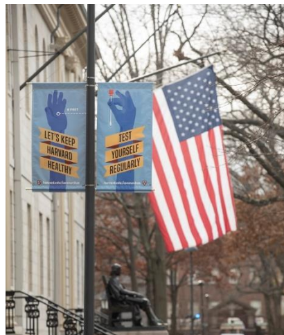
The American flag flying at University Hall, above the John Harvard statue and amidst signs saying "Keep Harvard Healthy", December 2020.

When a head of state or government would visit the University to give a public speech or to meet with Harvard's president during a normal year, the Marshal's Office would arrange for the visitor's national flag to fly from University Hall alongside the United States flag. Protocol dictates that the dimensions of the visitor's national flag must be the same as those of the United States flag; in the case of University Hall, 10' x 15'. Only countries and governments recognized by the U.S. Department of State may have their national flag flown. The Marshal's Office maintains an inventory of appropriately sized flags and manages the logistics of flying national flags at University Hall on such occasions.