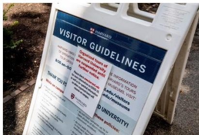
A sign in Harvard Yard stating the tours are suspended until further notice, July 2020.

During the summer and fall of 2020, the Marshal's Office assisted the staff of the Harvard Visitor's Center in the development of virtual tours of Harvard Yard. Some of the Marshal's Office's own virtual visitors took advantage of the opportunity to spend an hour over Zoom with undergraduate student tour guides who gave personalized virtual tours of campus. While virtual tour participants do not have the opportunity to pose for photos with the John Harvard statue in person, the virtual tour does allow a unique opportunity to share photos of interior spaces not usually accessible on a traditional walking tour. The virtual tours also include video clips and links to digital news articles to enrich the content of the tour along the way.